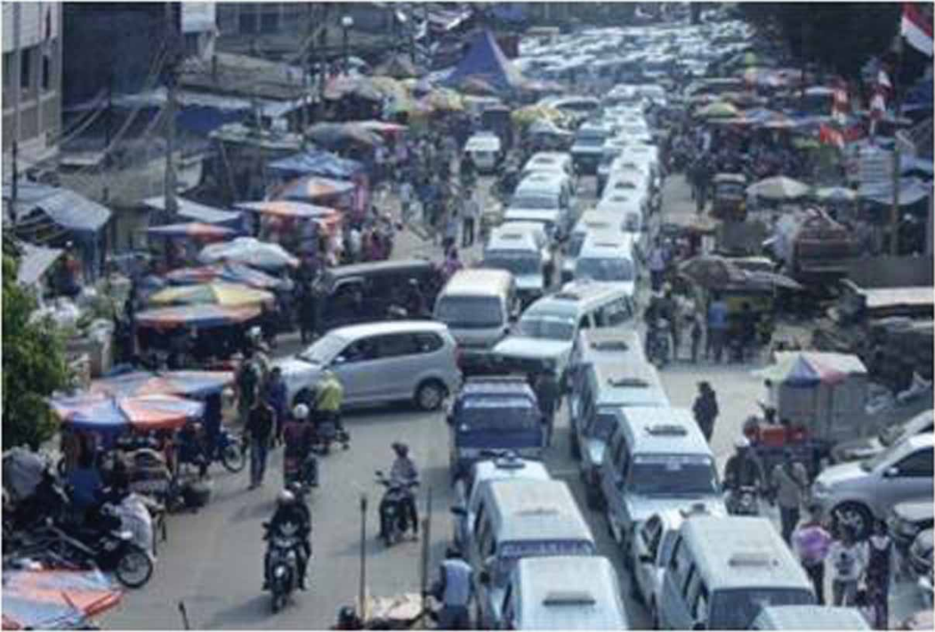
Figure 3 Neighbourhood extension of Tanah Abang Market.

domains that are highly visible. For example, Tanah Abang in central Jakarta is one of the world's largest textile and clothing wholesale and retail markets (Figures 1–5). It is officially the purview of municipal administration which in turn contracts its management to the city's largest property developer. This developer in turn subcontracts the daily management of the market's operations to a designated company formed for just this purpose. The company then largely relies upon the coordination of scores of unofficial groupings that are responsible for specific sectors, such as parking, transport, shipping, security, cleaning, leasing space and fee collection. This coordination comes from a shifting committee of fixers, dealers, enforcers and negotiators that work at the junctures of activities and spaces.