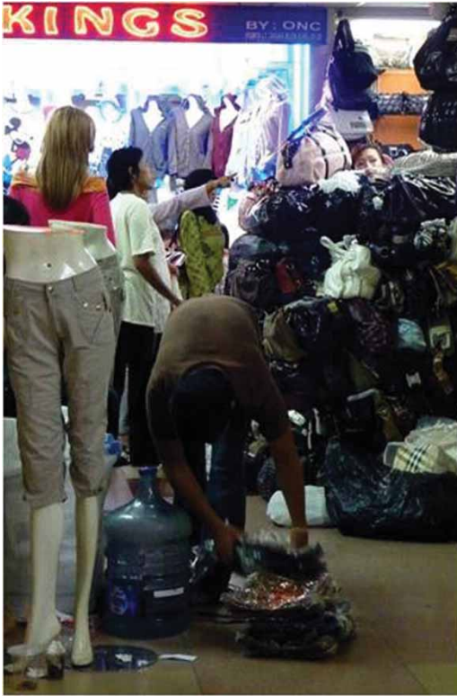
Figure 4 Re-bundling merchandise, Tanah Abang Market.

by control, one means the ability to regulate the large-scale importation of commodities, maintain highly favourable relationships with government officials that enable the circumvention of particular duties and taxes, and to have access to capital for investment, pay-offs and business consolidation. At the same time, such control is also expensive and limiting. It means retaining responsibility for labour, marketing, space and services that usually require uniform practices and consistent, year round outlays of expenditures. Profitability of the market depends upon its continuous penetration across diverse spaces, consumers, times, needs and capacities. It requires various surfaces of exposure and access, and this is best accomplished through enfolded into the market a wide range of production and retailing practices. Some 300,000 people use the market