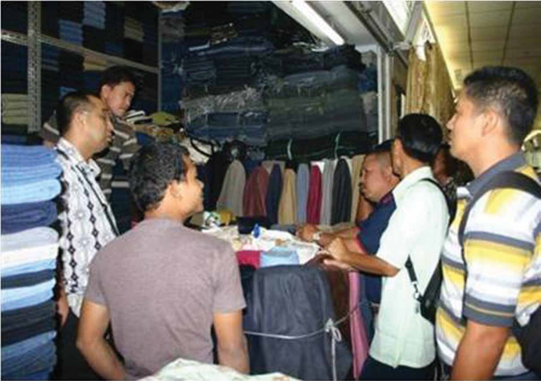
Figure 5 Working out the details of a pieced together wholesale deal, Tanah Abang Market.

or self-interest have time to rehearse themselves, time to yield even tentative results.