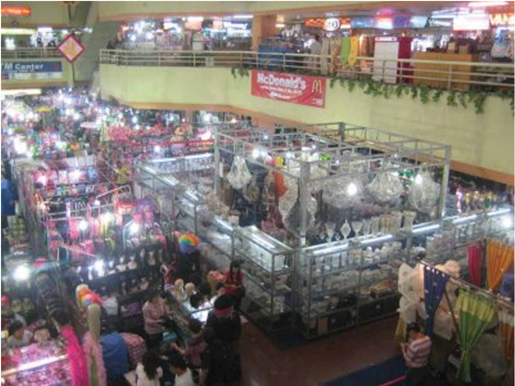
Figure 2 Scene from the floor an Tanah Abang Market, Jakarta.

It is difficult to address these questions in general. While it is valuable to focus on the otherwise marginalized dimensions of the city in the way, for example, McFarlane addresses the practices through which the poor concretely inhabit the city, perhaps it is important also to re-look at those