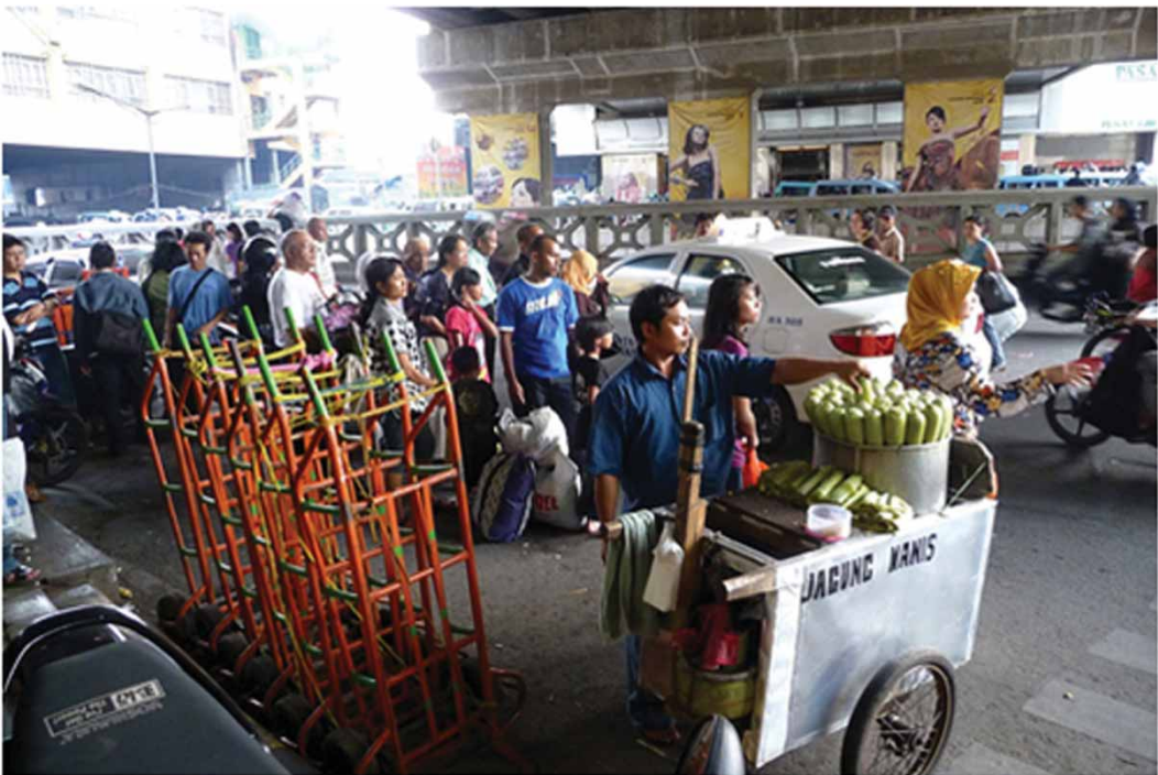
Figure 1 Waiting for transport outside Tanah Abang Market, Jakarta.

residents are kept scrambling for one provisional economic advantage after another, parochial social ascriptions are continuously reproduced to preclude mass mobilizations, and residents learn to rely upon their own wits rather than make sustained demands for a better life. These surfaces regulate relationships with various forms of control, most particularly with that of the state—the state that registers, surveys, accounts, disburses and accords a range of various right and responsibilities. However, there are other surfaces as well. There are those that face inside to a particular enfolding of populations and space—not necessarily communities or administrative districts—but zones of a felt commonality or shared past and present. Across these surfaces different kinds of affective and material economies are performed. Whereas predominant forms of regulation may compel residents to provide ‘accounts’ of themselves and to be accountable in terms of their management